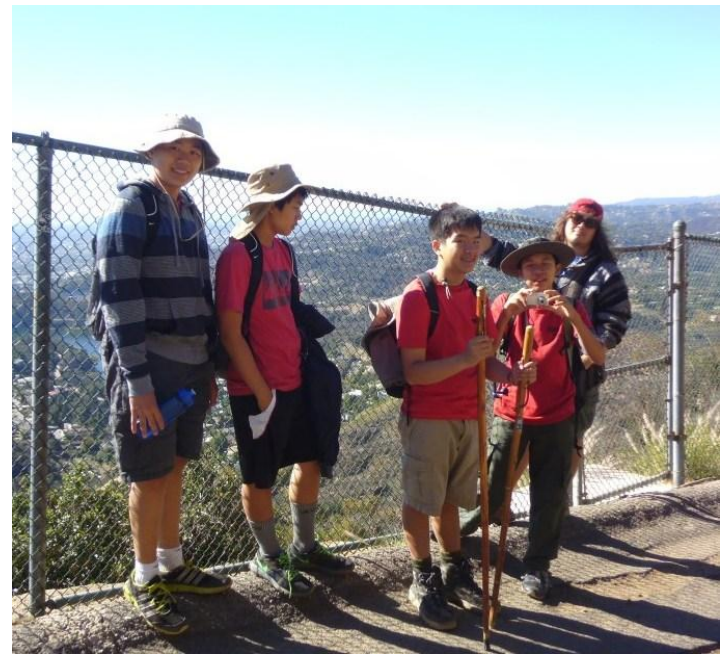
Some likely suspects hanging around near sign.