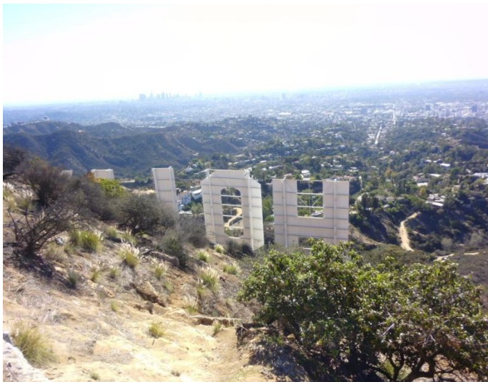
Looking down on Hollywood. We could see Griffith Park Observatory in distance.